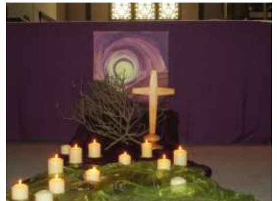
A focus for contemplative worship